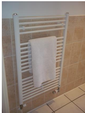
Heated towel rail

Bathroom: Each bathroom has a heated towel rail which will also be controlled by the central control panel. Each towel rail will also have an adjustor knob to the bottom right hand corner.